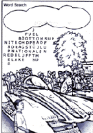
Streets of Fire & Lake Red Bluff Event

Sponsor a page to be a part of the group Project. Featuring: Lake Red Bluff, CA.